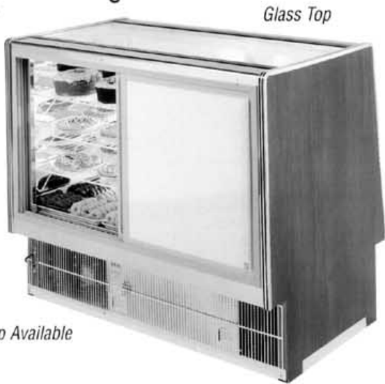
Solid Top Available