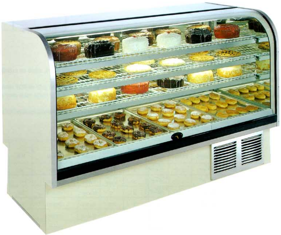
model shown BCR-6

BCD Series, High Volume Curved Glass Dry Bakery Display Case