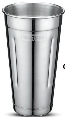
CAC20 Stainless Steel Malt Cup