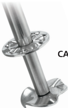
CAC112 Solid Agitator (6 pack)