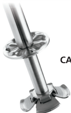
CAC123 Butterfly Agitator (6 pack)