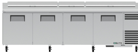
Straight-On Front View