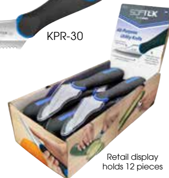
Retail display holds 12 pieces