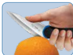
Pierce tough peels