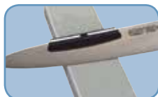
K-4G in use