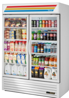
Optional White Exterior