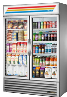
Optional Stainless Exterior