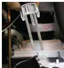
WaterSense Adaptive Purge Control

CU3030 - 300lb Self-Contained Ice Machine