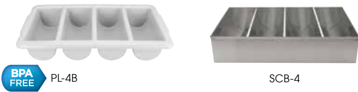
BPA FREE PL-4B