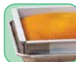
Make sheet cakes without cake pan