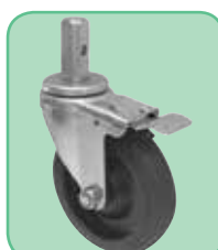
ALRC-5STK 5" caster with brake