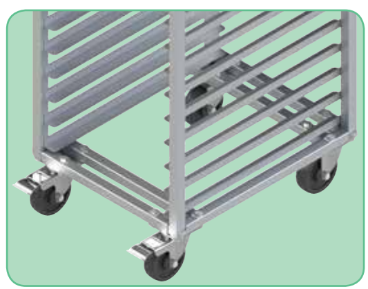
Double cross bars for extra strength