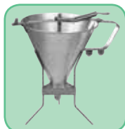
SF-7 &amp; SF-7R