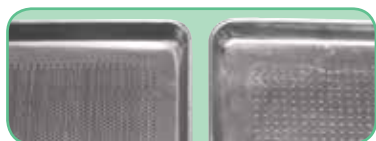
WINCO's "dense" perforation vs. others