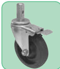
ALRC-5STK 5" caster with brake