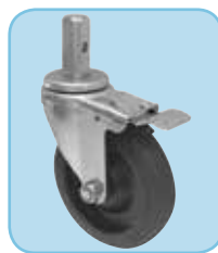
ALRC-5STK 5" caster with brake