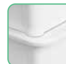
Seamless fit for fresh storage