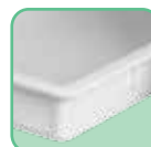
Reinforced edges & corners