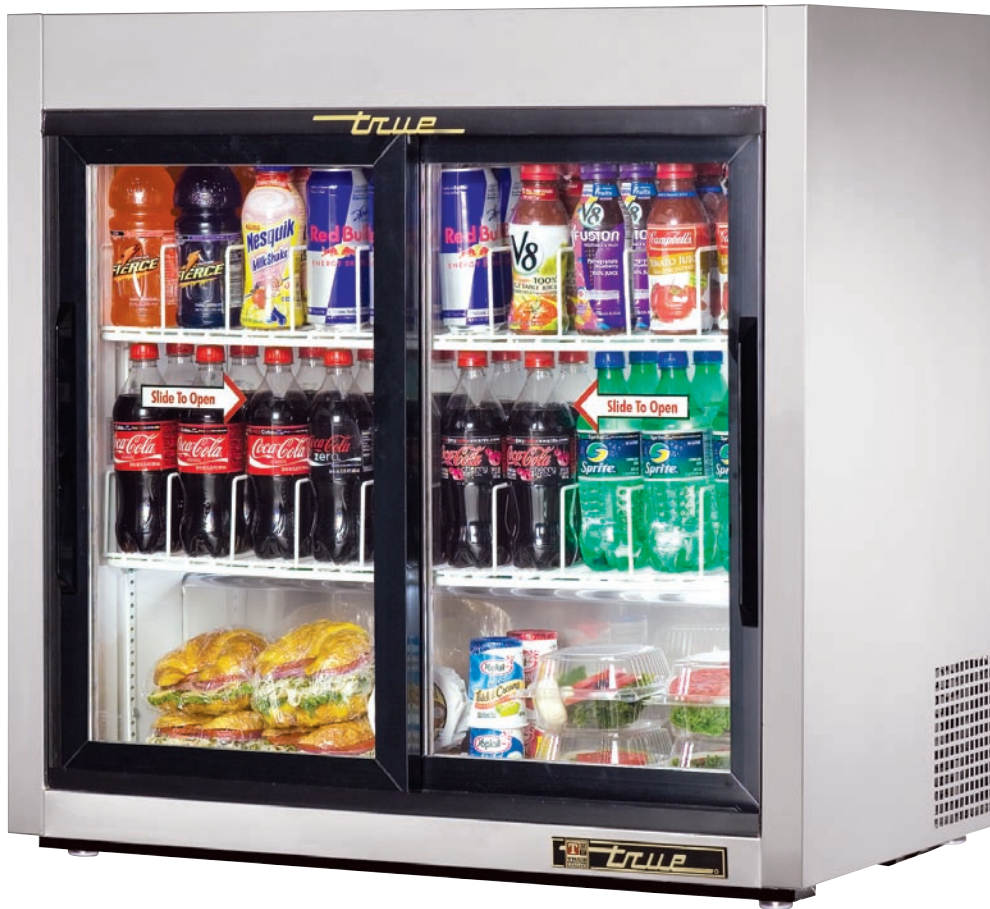
Model shown with optional organizers.

TSD Series: Reach-In Glass Slide Door Refrigerator