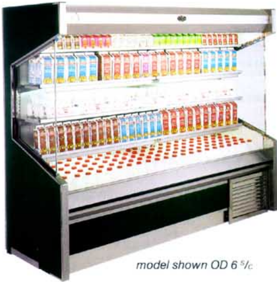
model shown OD 6 5/8