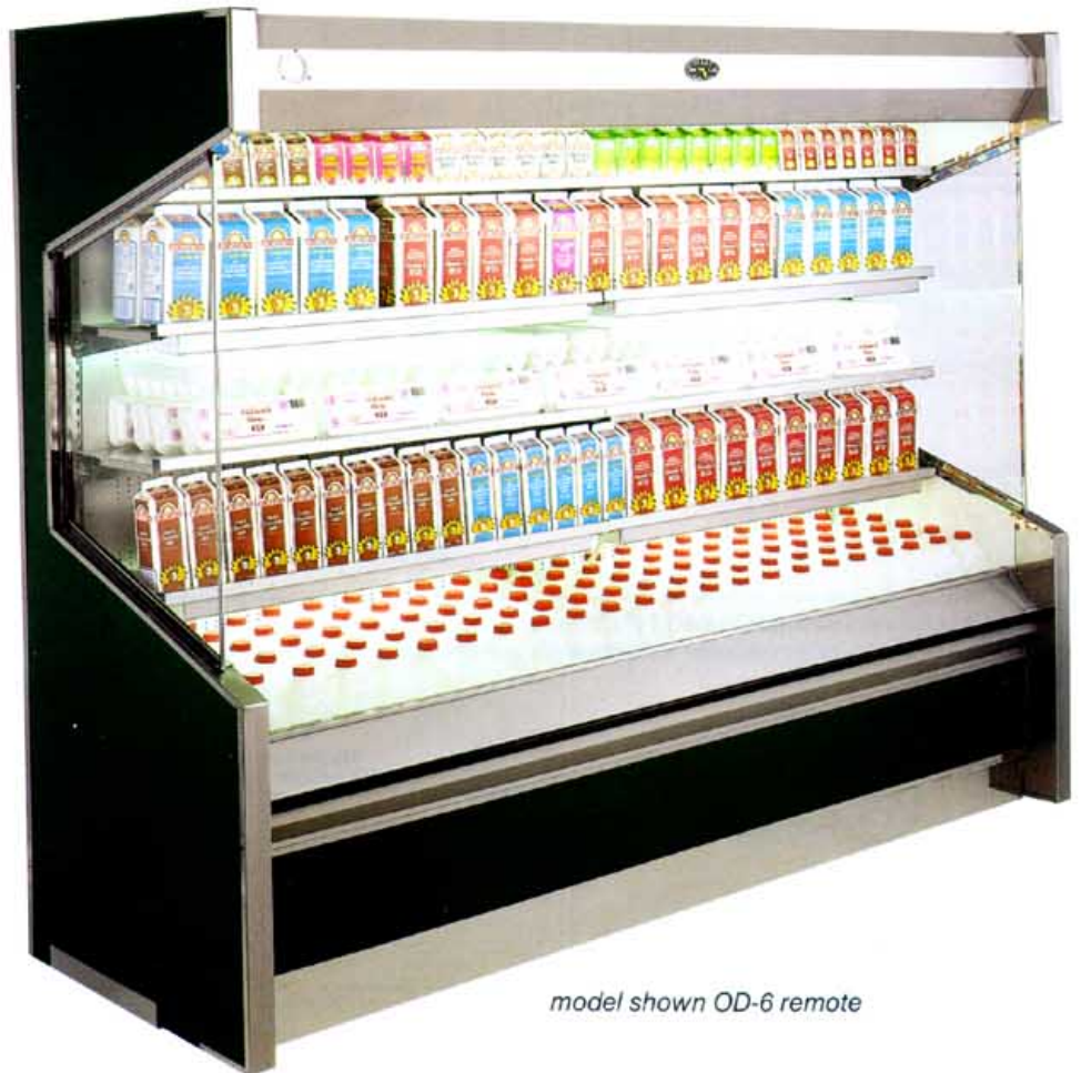
model shown OD-6 remote