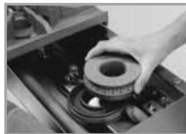
New standard Anti-Clogging burner head is shown. Anti-clogging pilot shield is designed into the top grate.