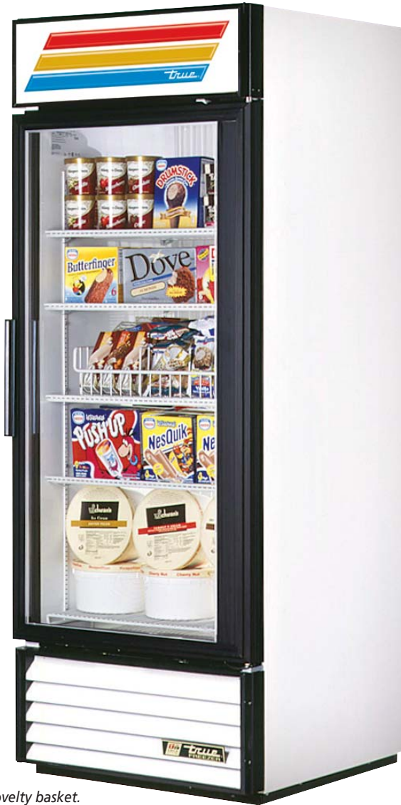
Shown with optional novelty basket.