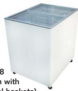
EURO-8 (Shown with optional baskets)