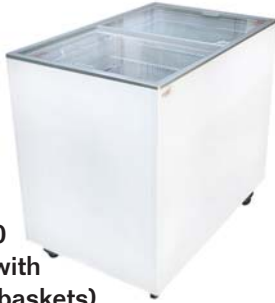
EURO-10 (Shown with optional baskets)