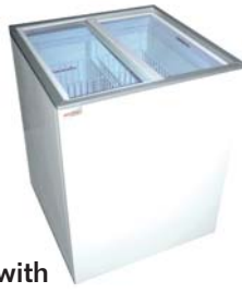
EURO-5 (Shown with optional baskets)