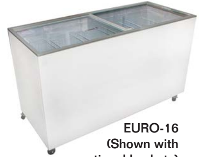
EURO-16 (Shown with optional baskets)