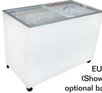
EURO-13 (Shown with optional baskets)