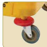
Non-marking casters with bumpers