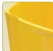
Easy-access slot on bucket fits 2" wide putty knife