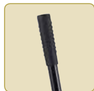
Powder-coated wringer handle with rubber grip