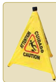
Set includes pop-up "Caution" cone