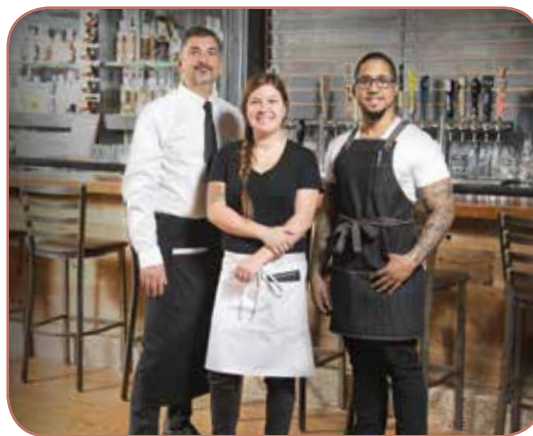
Models (L to R): 6' / 5' 3" / 5' 7"

INDIVIDUALLY PACKAGED IN PRINTED POLY-BAG