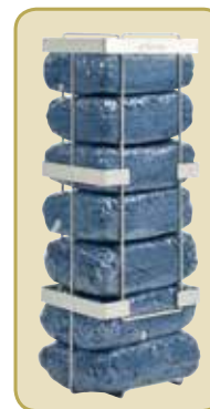
Dispenser holds 7 brick packs