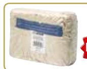
Brick pack is standard