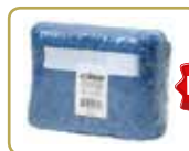
Brick pack is standard